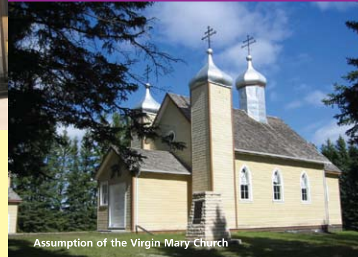
Assumption of the Virgin Mary Church