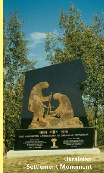
Ukrainian Settlement Monument

A large and impressive granite and bronze monument commemorating the 100th anniversary of Ukrainian settlement in Canada also marks the site where, in 1899, 42 children and 3 adults succumbed to scarlet fever on their way to homesteads being surveyed nearby. When a virulent strain of the fever and measles broke out in the group of 400 immigrants, the settlers had to be quarantined near Patterson Lake. A late spring snow storm combined with inadequate food and shelter caused the entire camp to become ill. Tiny wooden crosses that marked the shallow mass grave near the camp did not last and in 1915 a simple birch cross was erected. In 1941, a small concrete monument was built to mark the 50th anniversary of Ukrainian settlement in Canada and the site was designated a Municipal Heritage Site in 1990. From Olha, 4.2 km south on PR577 to the sign, and 1.5 km west or from Oakburn, 5.5 km north to the sign. Phone 204-859-2762.