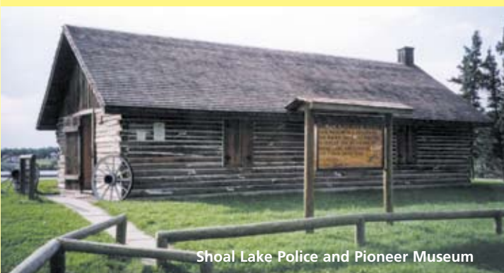
Shoal Lake Police and Pioneer Museum

The restored CPR station and residence located on Main Street in Strathclair is home to a collection of local artifacts and memorabilia. But of special interest is the fact that it also houses the original St. George's Hepworth Anglican Church and a blacksmith shop. Phone 204-365-2196.