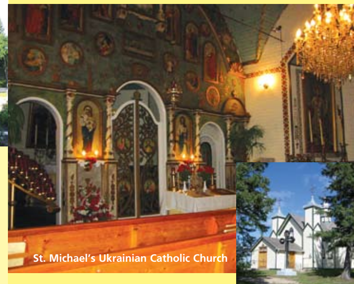
St. Michael's Ukrainian Catholic Church

Built in 1928 with timber from Riding Mountain, this Ukrainian Orthodox church is a fine example of a popular church design where a simple gabled nave section was embellished with the addition of corner towers and a raised centre dome. Both towers and dome are crowned with traditional banyas. The church was restored in 1997 and has been a municipally designated site since 1991. From Rossburn, travel north on PR264 and follow the signs. Phone 204-859-2762 or 859-2527.