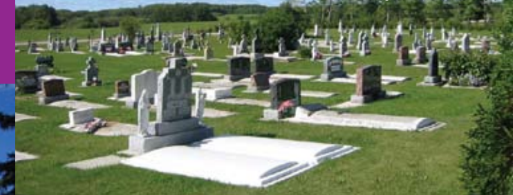
St. Michael's Ukrainian Catholic Church Cemetery (see #14)

Built in 1929 at a cost of $6000, this church is set on a traditional basilica plan with a long tall nave. The tower sections are crowned with a tall spire. Pointed arches cap the windows and doors. The church served both the Polish and Ukrainian settlers for a few years until separate Ukrainian churches were built. Prior to this, Father Kulaway visited the settlers on horseback and held mass at the Hrycak home. St. John Cantius became a Municipal heritage Site in 1991. Located southeast of Olha off PR577. Phone 204-234-5236.