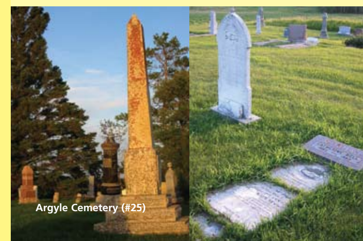
Argyle Cemetery (#25)

When lots were sold, residents bought according to where they lived in relation to the cemetery. Those living to the west of the cemetery bought plots on the west side, those on the east purchased on the east side and so on. The first interment in this cemetery was in December 1891. Three young children were buried here shortly after the Zion Church was established. With no consecrated ground nearby, two of them had been buried on the homestead when they died and were moved when another of the children also passed away. Following WWII, population had diminished and the church was closed. In 1958 it was dismantled and markers were bought for any unmarked graves. By 1988, an expansion to the east was planned.