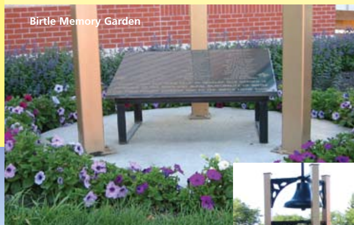
Birtle Memory Garden

Displays of local artifacts collected since the museum's opening in 1984 are showcased on the main floor of this former bank. The vault is used for document storage and at one time it served to protect as many items as could be packed inside when a fire broke out next door. The upstairs has been re-created as a 1903 home. Phone 204-842-3363.