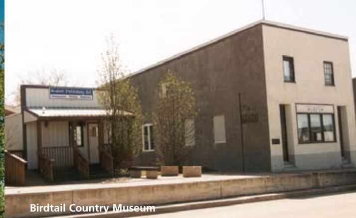
Birdtail Country Museum

During their historic 1874 journey west, the Northwest Mounted Police built a barracks south of Shoal Lake in 1875. The museum is a replica of the original barracks and houses a collection of NWMP and early RCMP items along with artifacts from the pioneers in the area at that time. Phone 204-759-2429