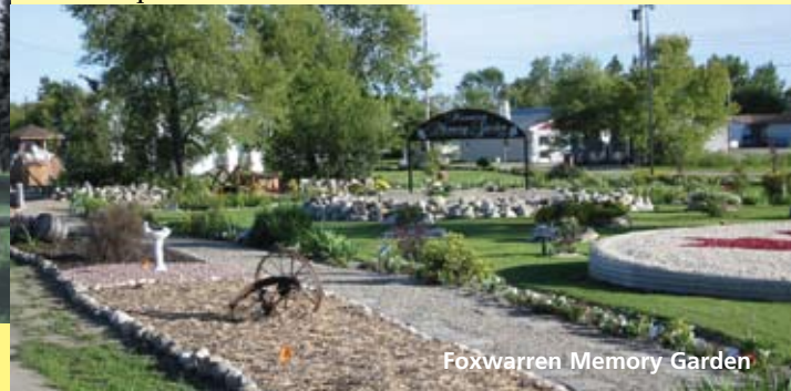
Foxwarren Memory Garden

Located in the former St. George's Anglican Church (built in 1906), the Foxwarren Museum houses the church's altar and three rows of pews, along with a pioneer home display of Foxwarren artifacts. The museum also houses the records of many community organizations that are no longer in operation. Open Tuesdays and Thursdays, 2:00 pm - 4:00 pm, from May to October, or on request.